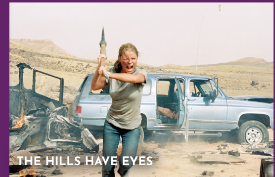
THE HILLS HAVE EYES