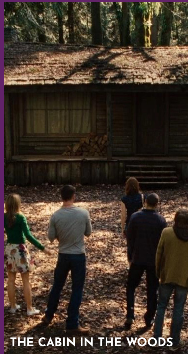
THE CABIN IN THE WOODS