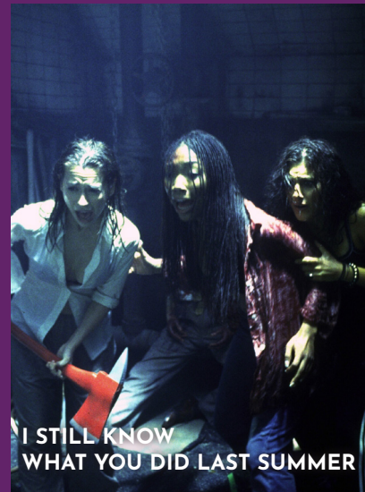
I STILL KNOW WHAT YOU DID LAST SUMMER