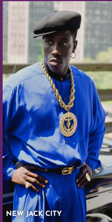
NEW JACK CITY