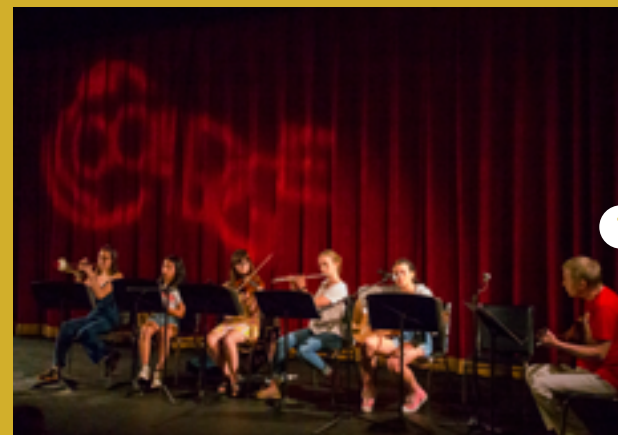
1 Students from the Brookline Music School performing before a Cinema Jukebox® presentation of Gimme Shelter

We put on 35mm outdoor screenings of Rear Window, Raiders of the Lost Ark, Revenge of the Creature, and The Incredible Shrinking Man as part of the fourth year of our Coolidge at the Greenway partnership