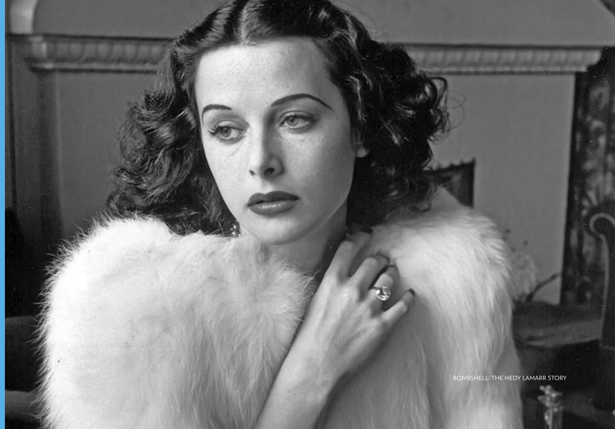
BOMBSHELL: THE HEDY LAMARR STORY