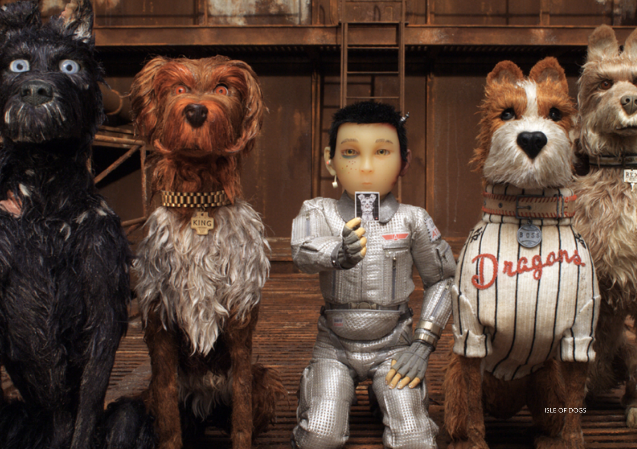
ISLE OF DOGS